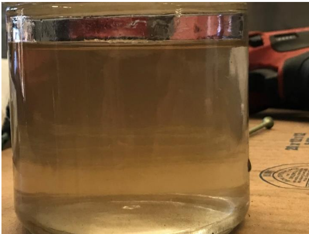
Microbiological count over 100,000 cfu/mL Iron level at 3.42 ppm

Chilled water system at a hospital that has been dosed with liquid biocides, iron dispersant and cleaners over a two-year period with little to no effect on cleaning up. System has a large bypass 25-micron bag filter system. 2 x 150-gram bags of ProMoss were added to the bag filter and changed out twice (1/month). Pictures above show the before and after results. ProMoss was able to completely clean this system up in two months with complete elimination of all microbiological activity and residual iron.